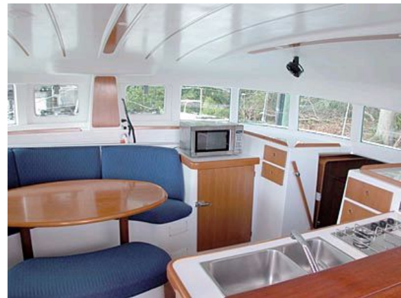
Lagoon salon and galley